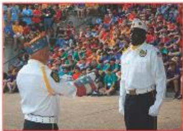
The American Legion conducts a flag retirement ceremony in presence of Boys State delegates.