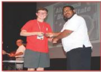
Delegate being awarded medal for outstanding merit during the week by staff counselor.