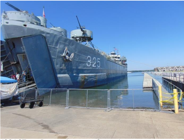
USS LST 325 Decatur August 29-September 3, 2019