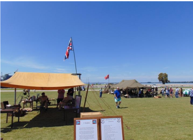
Forefront: British Re-enactors Back: U.S. Marine Corps Re-enactors