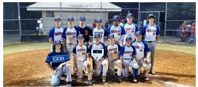
Post 237 baseball team wins Guntersville tournament.