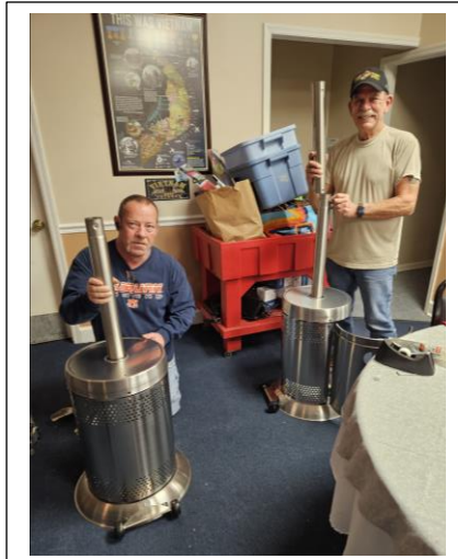
Left: Picture of the new outdoor patio. Fans are hung, tables and chairs and heaters are ready to go!