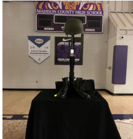
“Soldiers Cross” first appeared in the US during the Civil War