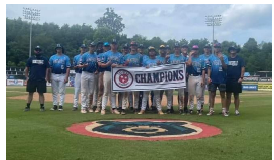
Smokies Summer Slam Champions!