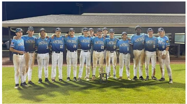
2024 Post 237 Team at Alabama State Tournament

Jun 4 6/8:30PM @ Central High Florence, AL Jun 11 6/8:30PM Post 31 @ John Hunt Park Jun 14-16 TBD @ NE Mississippi Community College Jun 18 6/8 PM @ Red Bay HS Jun 19 6/8 PM vs. Post 229 @ John Hunt Park Jun 21-23 TBD Troy University Showcase Troy, AL Jun 25 6/8 PM @ Colbert Tuscumbia, AL Jun 28-30 TBD @ Smokies Stadium Kodak, TN Jul 1-8 OFF – Possible Workouts Jul 9 6/8 PM vs. Red Bay @ John Hunt Park Jul 10 6/8 PM @ Post 229 Bob Jones HS Jul 12 TBD @ John Hunt Park Huntsville, AL Jul 19-21 State Tournament Tuscaloosa, AL