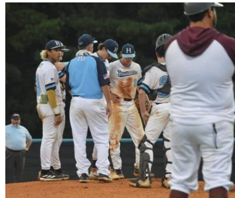
Meeting on the mound.