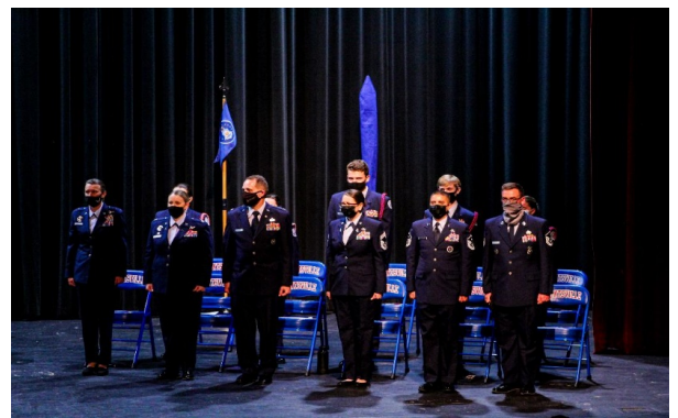
Air Force ROTC Instructor Staff, Dignitaries and Cadet Command Group.